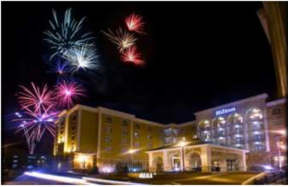
100% Non-smoking Hotel